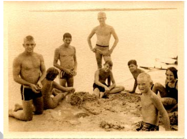
At the Beach Rockport