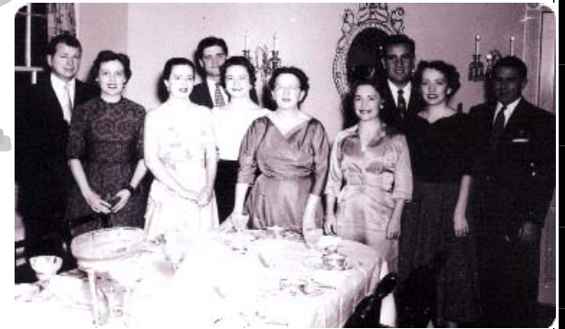
Christmas Eve Houston