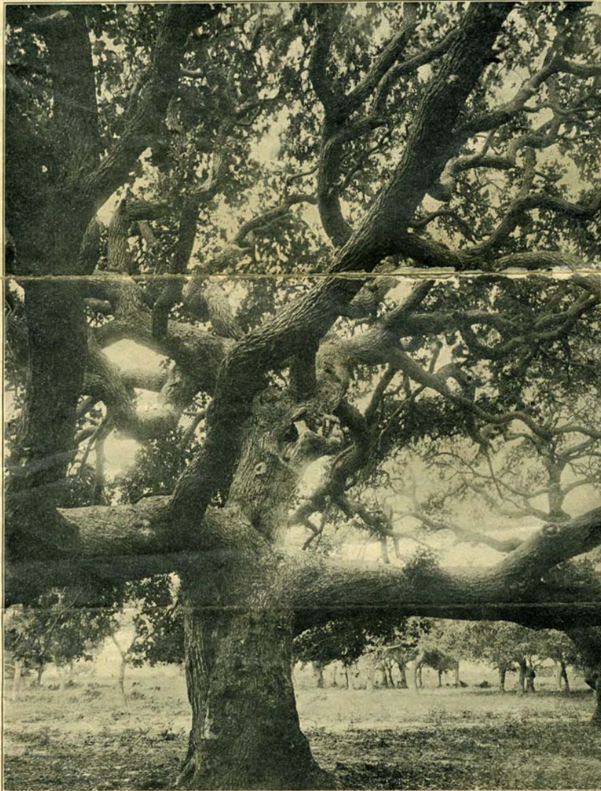
THE HISTORIC OLD LIVE-OAK AT ROCKPORT, TEXAS, KNOWN AS THE "ZACK TAYLOR TREE." THIS IS WHERE HE CAMPED IN 1845 ENROUTE TO MEXICO. BEAUTIFUL TREES ARE ONE OF THE MANY CHARMS OF ROCKPORT AND VICINITY.