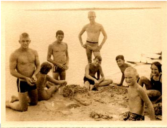
At the Beach Rockport