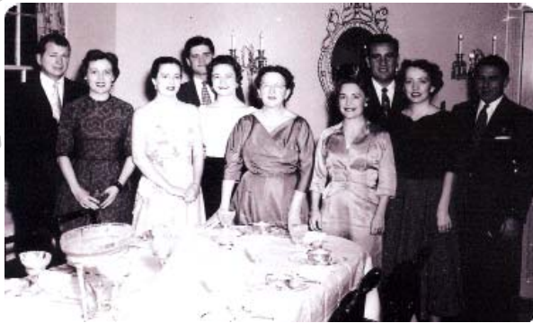
Christmas Eve Houston