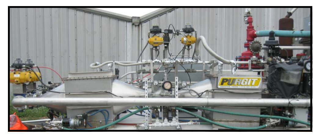
With a Purgit refrigerated VRU the following benefits are realized: