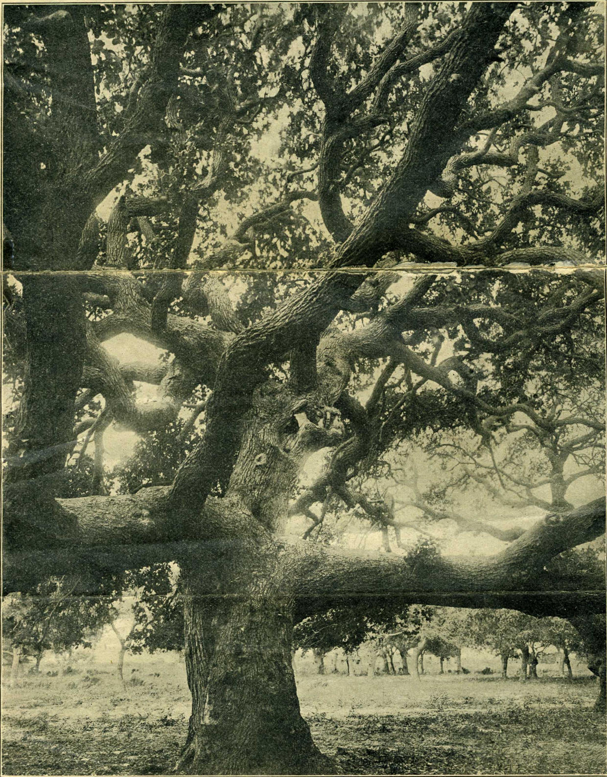
THE HISTORIC OLD LIVE-OAK AT ROCKPORT, TEXAS, KNOWN AS THE "ZACK TAYLOR TREE." THIS IS WHERE HE CAMPED IN 1845 ENROUTE TO MEXICO. BEAUTIFUL TREES ARE ONE OF THE MANY CHARMS OF ROCKPORT AND VICINITY.