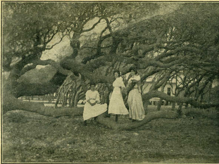
Rockport is Noted for its Beautiful Trees Along the Bay Front.

GULF COAST IMMIGRATION CO. ROCKPORT, TEXAS