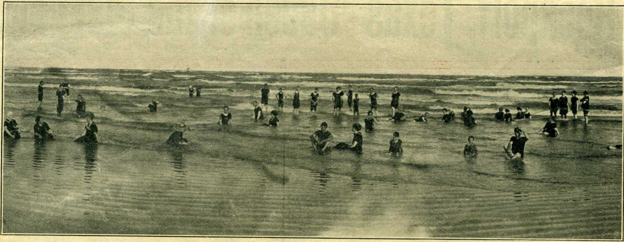
A SURF BATHING PARTY IN THE BREAKERS OPPOSITE ROCKPORT, TEXAS—Midwinter Surf Bathing is One of the Chief Attractions Here.